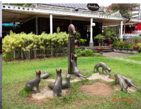
Statues of cats.