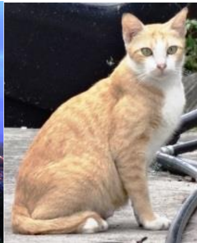
A native cat.