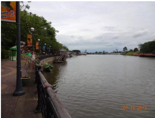
View of harbor along the Sarawak River.