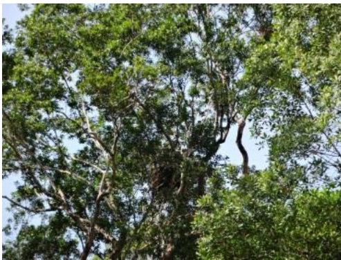
Semenggoh Wildlife Rehabilitation Centre. Orangutan habitat (left).