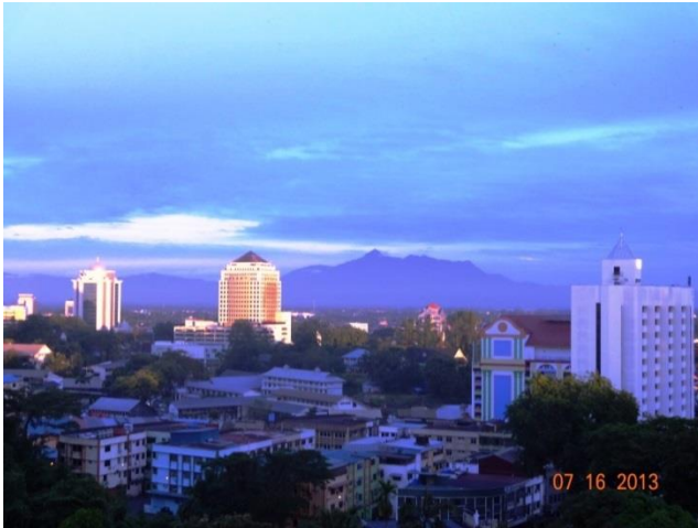
The City of Cat “Kuching in Sarawak”