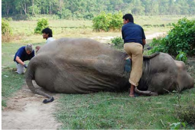
Chitwan Wildlife Conservation Park