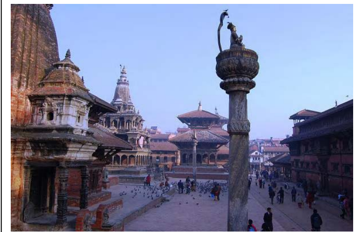
Patan Durbur square