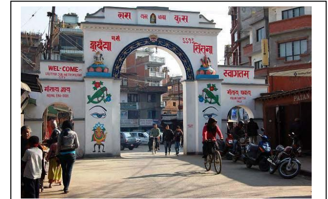
Gate of Patan