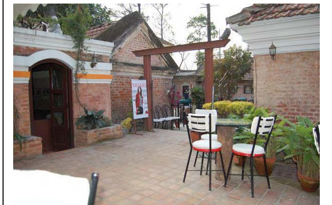
Yala Maya Kendra, Patan